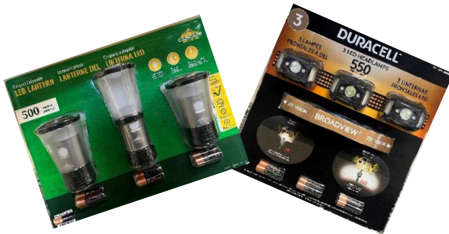
Lantern or Headlamp - Set of 3