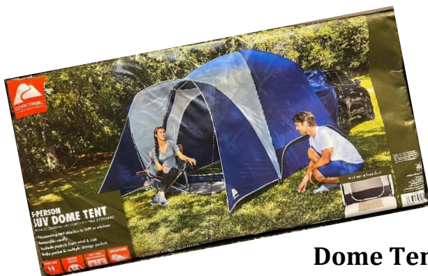
Dome Tent or Camp Stove